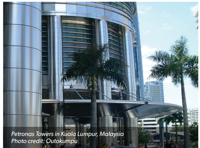
Petronas Towers in Kuala Lumpur, Malaysia

On a grander scale, the Petronas Towers in Kuala Lumpur, Malaysia is a more complicated Cambric profiled finish on a base 316 metal with BA stock. The profiled finish is to avoid blinding reflections while using a 316 base metal with a mill finish that has the highest corrosion resistance available.