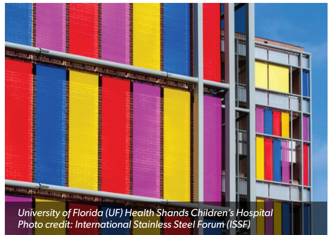
University of Florida (UF) Health Shands Children's Hospital