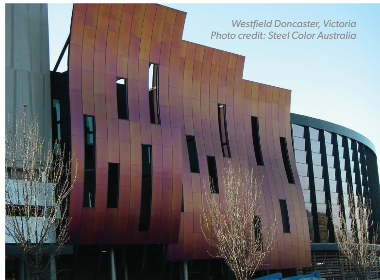
Westfield Doncaster, Victoria

These colours are very durable, even in Australia, as they do not fade with UV exposure and, in a graffiti-infected urban environment, solvents can be used to remove tags and other unwanted additions to coloured facades and signs. However, they are not repairable if scratched and can only be mechanically fixed as welding locally destroys the coloured film.